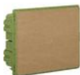
F315SC8 Flush-mounting box (green) for plasterbo...