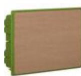
F315SC12 Flush-mounting box (green) for plasterbo...