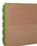
F315SC36D2 Flush-mounting box (green) for plasterbo...