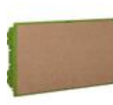
F315SC18 Flush-mounting box (green) for plasterbo...